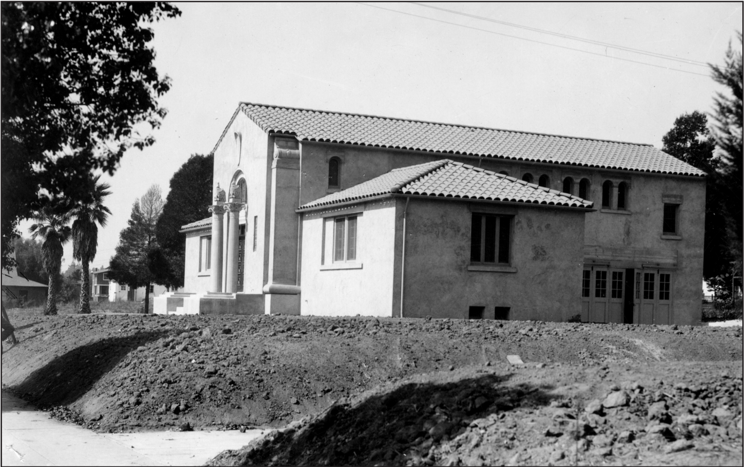
1922-The City Hall was built by Eagle Rock City to accommodate the offices of the rapidly growing community.