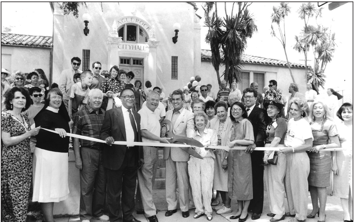
1994- Reopened after earthquake and disability access retrofitting, the building was repainted inside and out. The historical Society museum was moved to the lower floor.