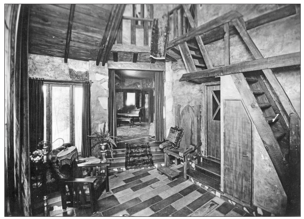
The entry of the house appears as a Norman village with balconies, exterior windows and roofs-all inside. "An Architectural Guidebook to Los Angeles" quipped, "One might expect Hansel and Gretel to appear at any moment".