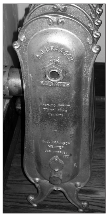
Albert's heating business supported it all. This vented gas heater is disguised as a "Radiator".