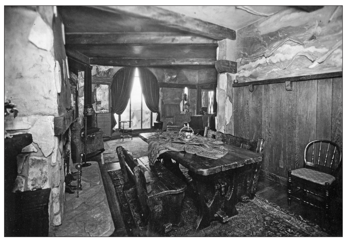
The dining room, with three-dimensional murals by Constance Braasch.