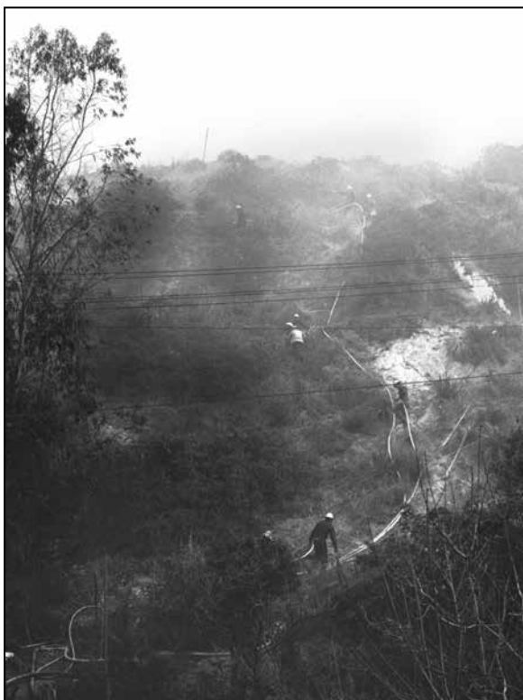
Firemen struggle up steep hillsides to get water on the thick chaparral.

The Eagle Rock Sentinel caption: "A woman flees from her home on Hartwick Avenue in Eagle Rock Monday afternoon as flames sizzled over the top of mountains from Glendale and raced down the slope. Powerful winds, careening through the area like a drunken, invisible giant knocked down trees, smashed signs and windows and fanned the hot fire that engulfed 16 Eagle Rock homes, completely destroying eight and partially destroying eight others, most of them located in the canyon-like streets north of Hill Drive. Heroic firemen and volunteer residents (on rooftop) saved the homes on this street."