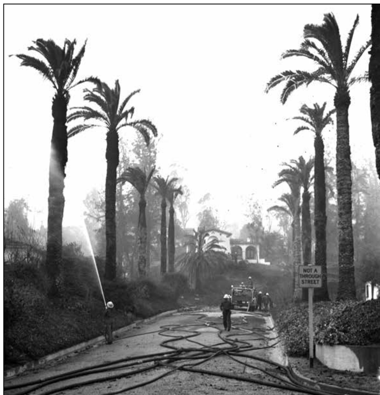
On La Roda Avenue, firemen wet down vegetation and vulnerable houses.