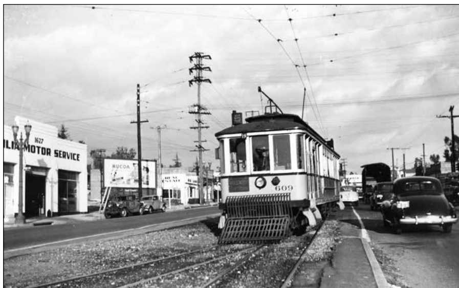
The trolley car is shown near the end of the line at Townsend Avenue in 1946. The switch that allowed the car to return on the double-tracked right-of-way is shown in the foreground.

The trolley stop at Argus Drive looking West in March of 1948.