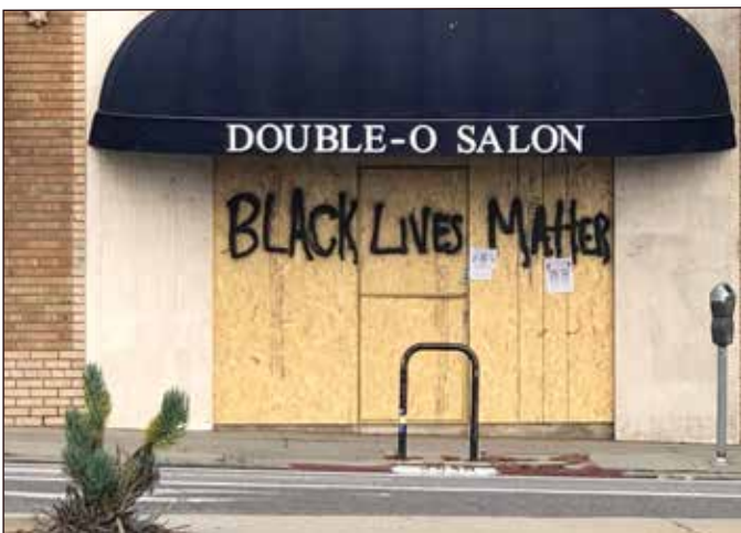
Boarded up on Eagle Rock Blvd, June 6, 2020