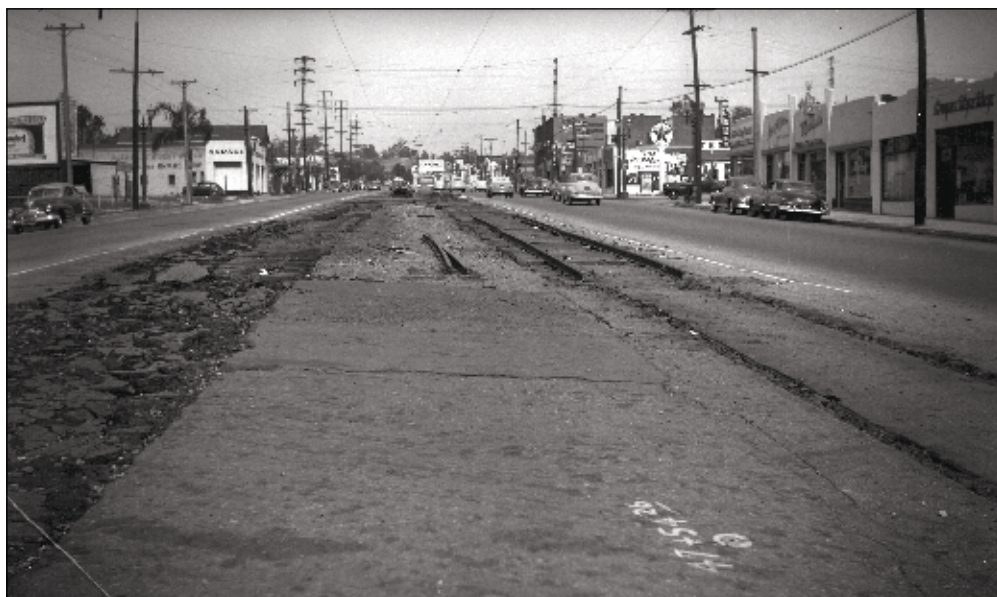
The trolley tracks are removed in this view east from Mt. Royal Drive in June of 1946.