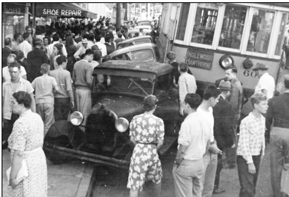
In December of 1946 a trolley car's brake failed when it was stopped and due to gravity, it accelerated coming downhill from Townsend Avenue. It failed to make the turn at Eagle Rock Boulevard and crashed into parked cars on the west side near where Chipotle is now. (ERVHS)