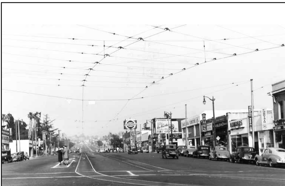
The intersection of Colorado Boulevard looking east from Eagle Rock Boulevard in 1946. The passenger boarding area is shown to the left of the tracks.