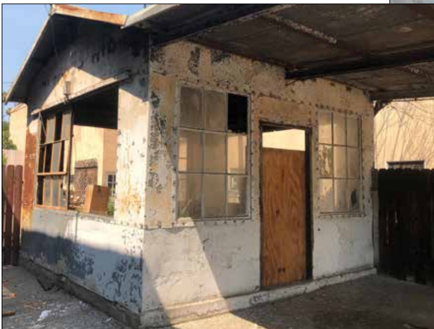
The current condition of the building. Having decided that they wished the building to be removed the new owners, contracted with a developer to remove and possibly re-use the building. Based on his personal judgment, the developer began an unpermitted and ill-advised effort to dismantle the building. At present the doors have been removed to another location and the window frames are piled behind the building.