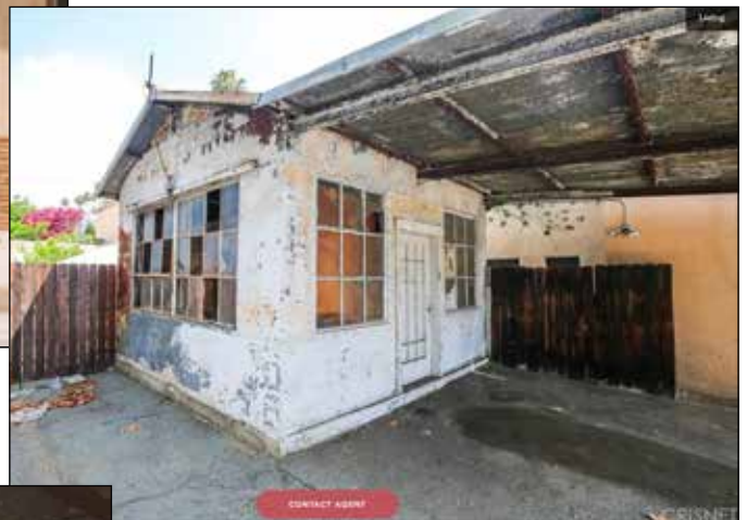
The condition of the building in 2021 at the time of the property’s sale with the Clairville building on the adjoining lot at 1655.