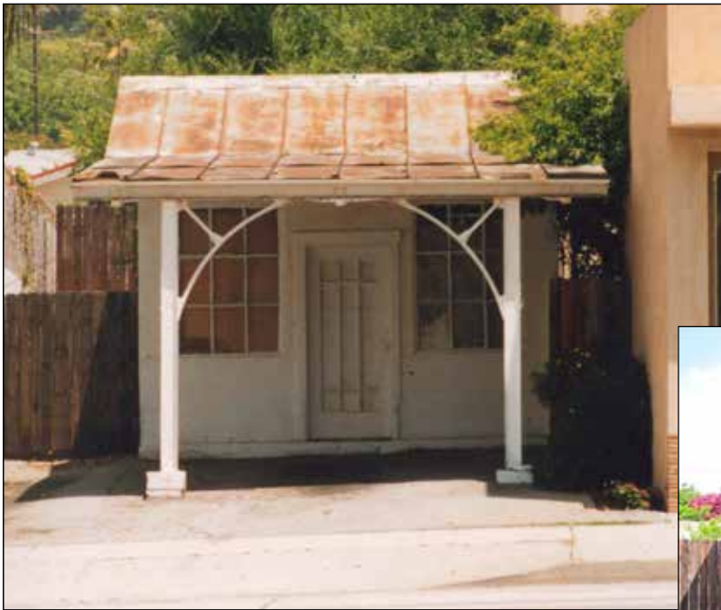
The station at 1659 Colorado Boulevard as it stood in 1998, photographed as part of a survey of the commercial buildings in 1998.

Survey LA, a comprehensive survey of historic structures throughout the city, described the building thus “One exceptional example is a modest service station building dating from 1919. Originally constructed on: Spring Street in Downtown Los Angeles, and moved to its current location on Colorado Boulevard in 1931, this property appears to be the oldest remaining service station building in the city.”