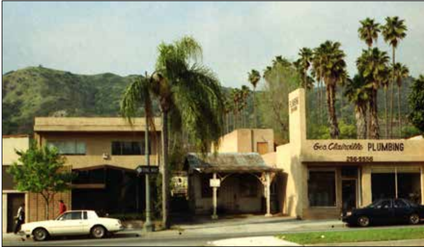
The station and the adjoining buildings photographed as part of a survey of commercial buildings on Colorado in 1988.