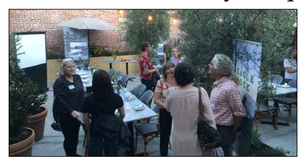
The crowd assembles on Blair's Restaurant's Patio anticipating the feast.