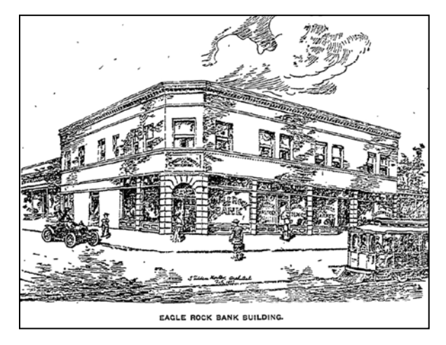
The architect's rendering of the proposed building, 1907.

A n announcement in the Los Angeles Times in February, 1907 described the building: