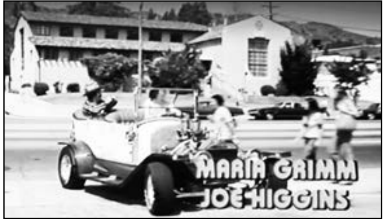
This shot from the credits of the film shows the 1927 Eagle Rock Library in the background. Neither of the named actors are in the shot. Kinkey Friedman is riding in the back seat of the Hot Rod.

The "Asian Nutrition Center" in the store front next to the library may have been the earliest provider of "Oriental Foods" in central Eagle Rock, although the long running "Lee's Kitchen" may have begun earlier.