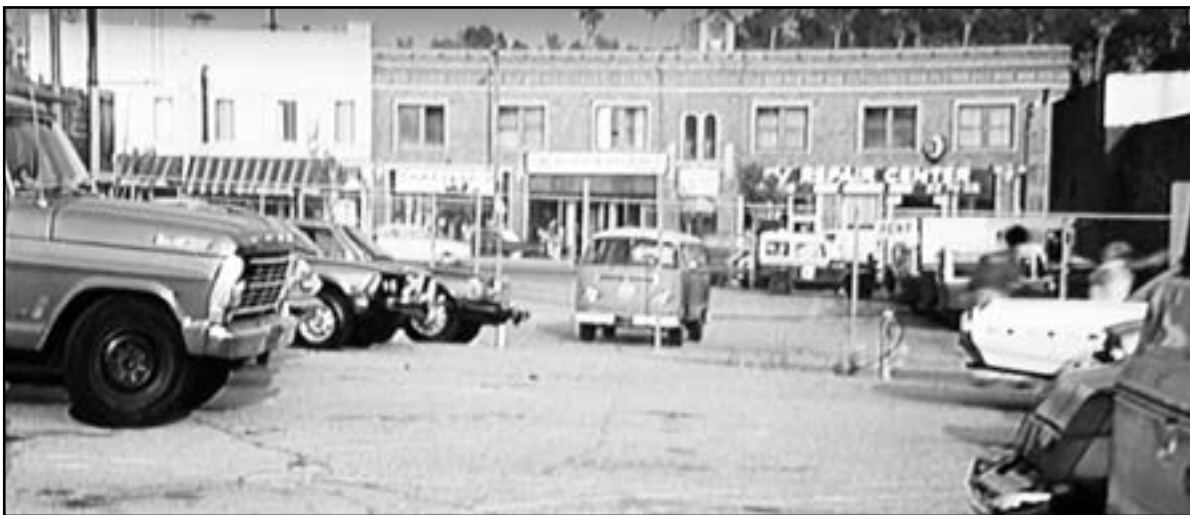
This shot from behind the Shopping Bag building shows the corner of Eagle Rock Boulevard and Merton Avenue. Thankfully the tin signs which were used to "modernize" the older buildings have now been removed. The left hand building is the old Masons Hall which housed in 1916, in the right-hand store front, Eagle Rock's first moving Picture Theatre and in left-hand store front Eagle Rock's City Hall.